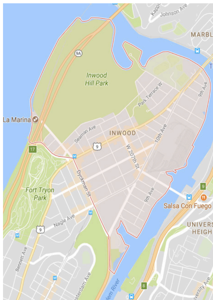
Figure 2- Inwood location

Private sector investments have also aroused worries about gentrification. A New York Times article